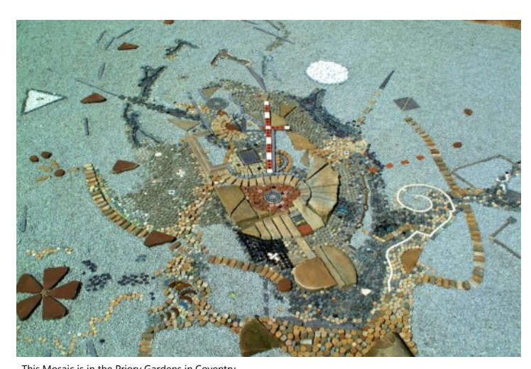
This Mosaic is in the Priory Gardens in Coventry Freefoto.com Creative Commons Attribution-Noncommercial-No Derivative Works 3.0 License

http://glitteringshards.com/mosaic-courses-london/make-mosaics-with-children/