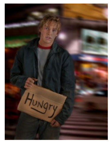
Public Domain image