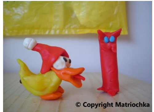
Both images are licensed for reuse under this Creative Commons Licence